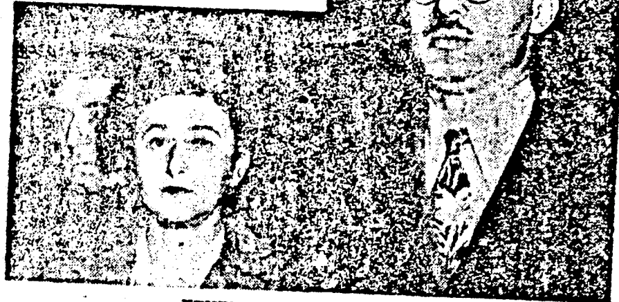
ETHEL AND JULIUS ROSENBERG

On April 6, 1951, the day following the sentencing, the Forward editorial, entitled "Top Horrible," began: "When we editors got the news that Julius and Ethel Rosenberg were sentenced to death, a shudder passed through all of us. For a moment we sat as if stunned and found it hard to catch our breath.